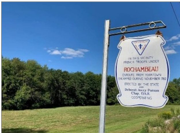
Sign marking the route of Rochambeau’s

Samuel Dorrance’s Inn is one of a few places mentioned by name in multiple accounts written by French officers. It is one of the sites along the 3.6 miles of the “March Route” of Rochambeau’s Army on the Plainfield Pike. The trail covers 120 miles through Connecticut. A neighbor told me that this field was once part of the 22 acre farm, and some of the troops set up camp here to guard Rochambeau’s officers.